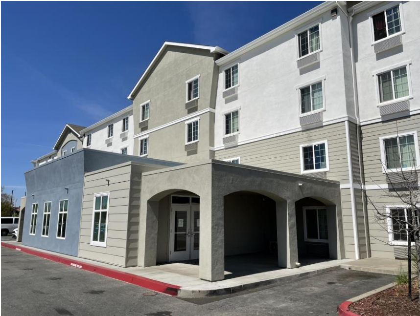
Los Molinos (La Mancha) Apartments