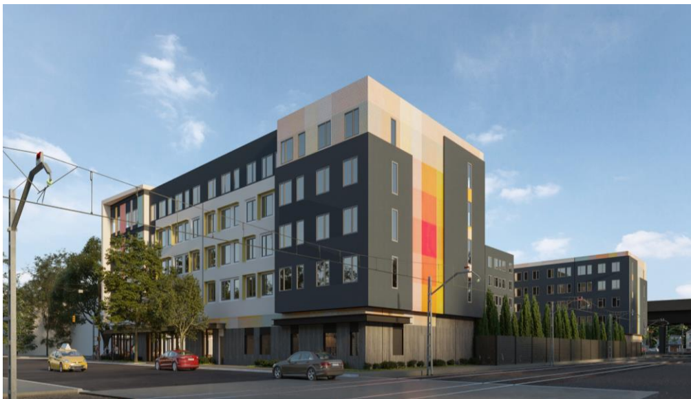
On Broadway, rendering