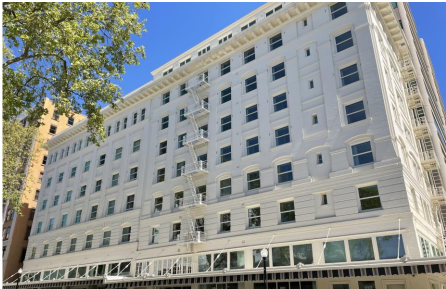
The Saint Clare at Capitol Park