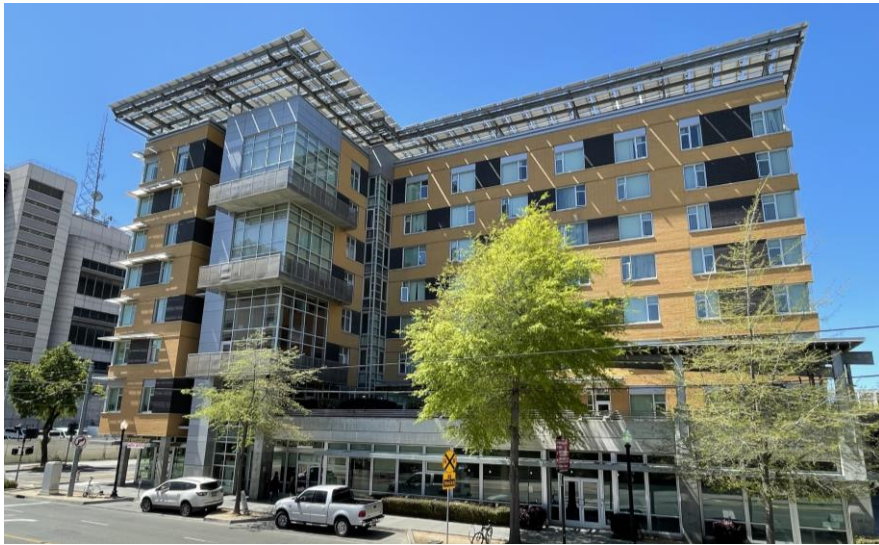
7 th and H Street