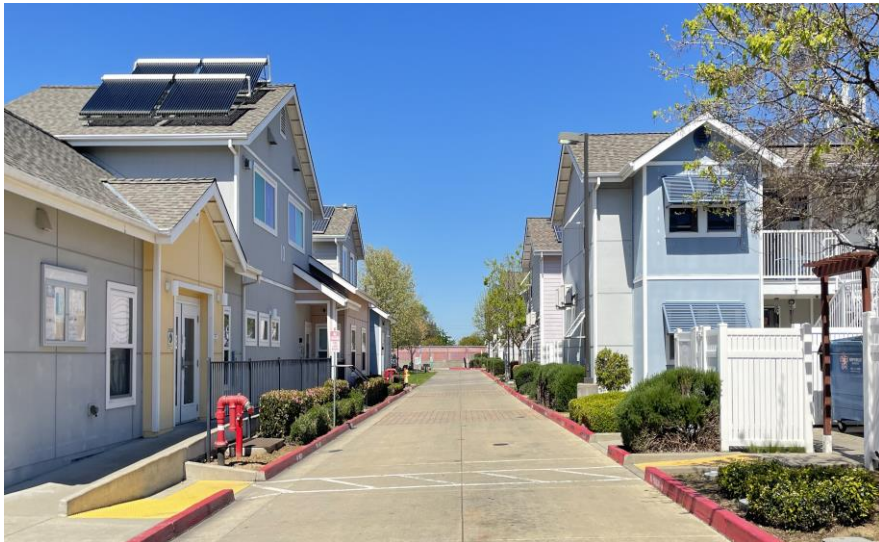
Mutual Housing at the Highlands