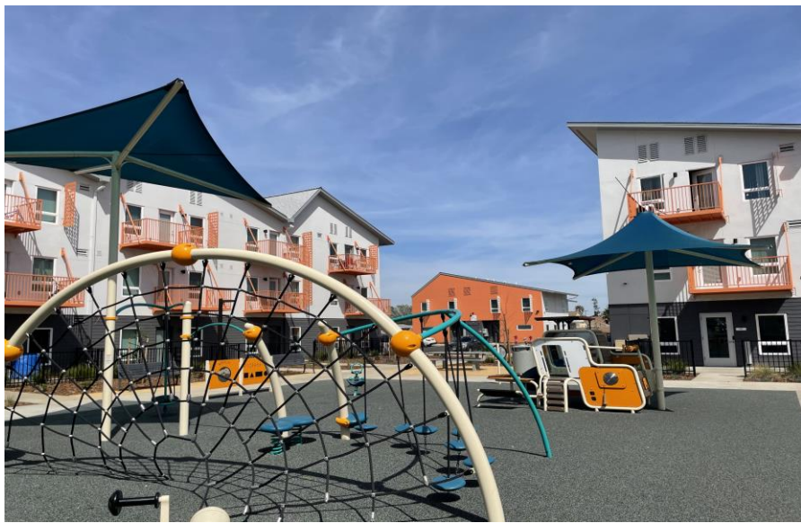
Mutual Housing on the Boulevard