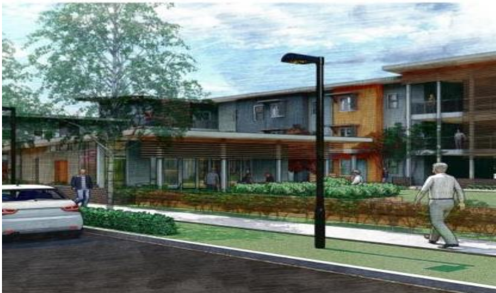
Donner Field, artist rendition