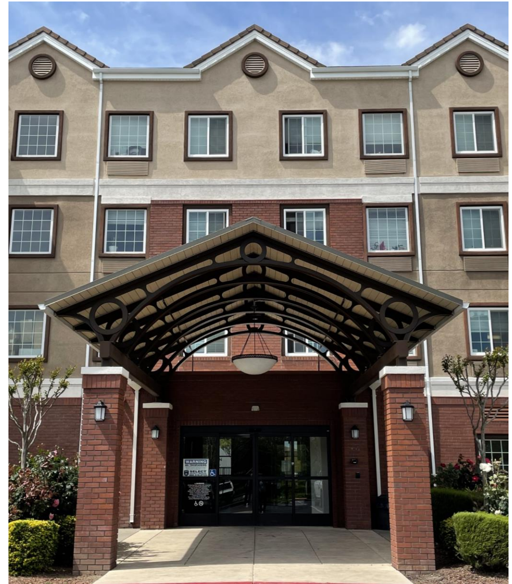
Vista Nueva Apartments

Permanent Supportive Housing (PSH) is an innovative and proven solution for individuals and families living with serious mental illness who are experiencing or at-risk of homelessness. It combines affordable housing with intensive behavioral health services provided on site. PSH is successful, reduces high-cost crisis care, and beneficial to clients, families, and our communities.