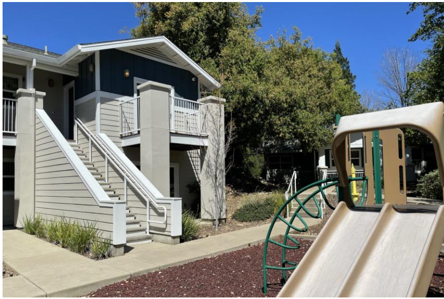
Folsom Oaks Apartments