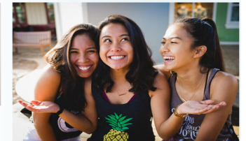
Tuaj yeem kho kom