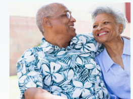
Muaj kev pab!