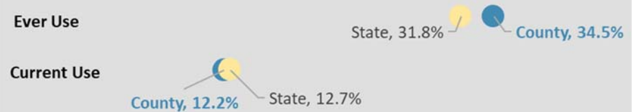
Figure 3: Any Smoking Pre-Pregnancy and During Pregnancy for Sacramento County Mothers Giving Birth in Years 2009-2018