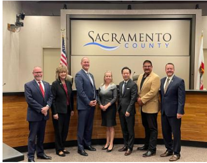
Sacramento County Leadership Department of Health Services