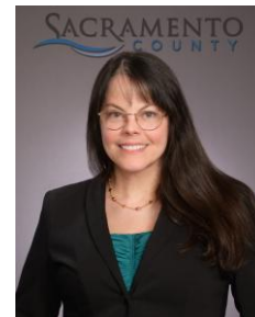
Chief Medical Officer