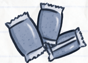
SNUS Small pouch of wet snuff