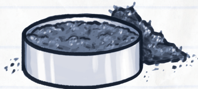
SNUFF Ground tobacco that can be sniffed or put between your cheek and gums