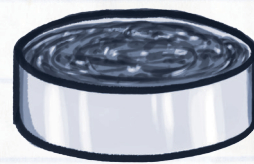
DIP Wet snuff that is chewed